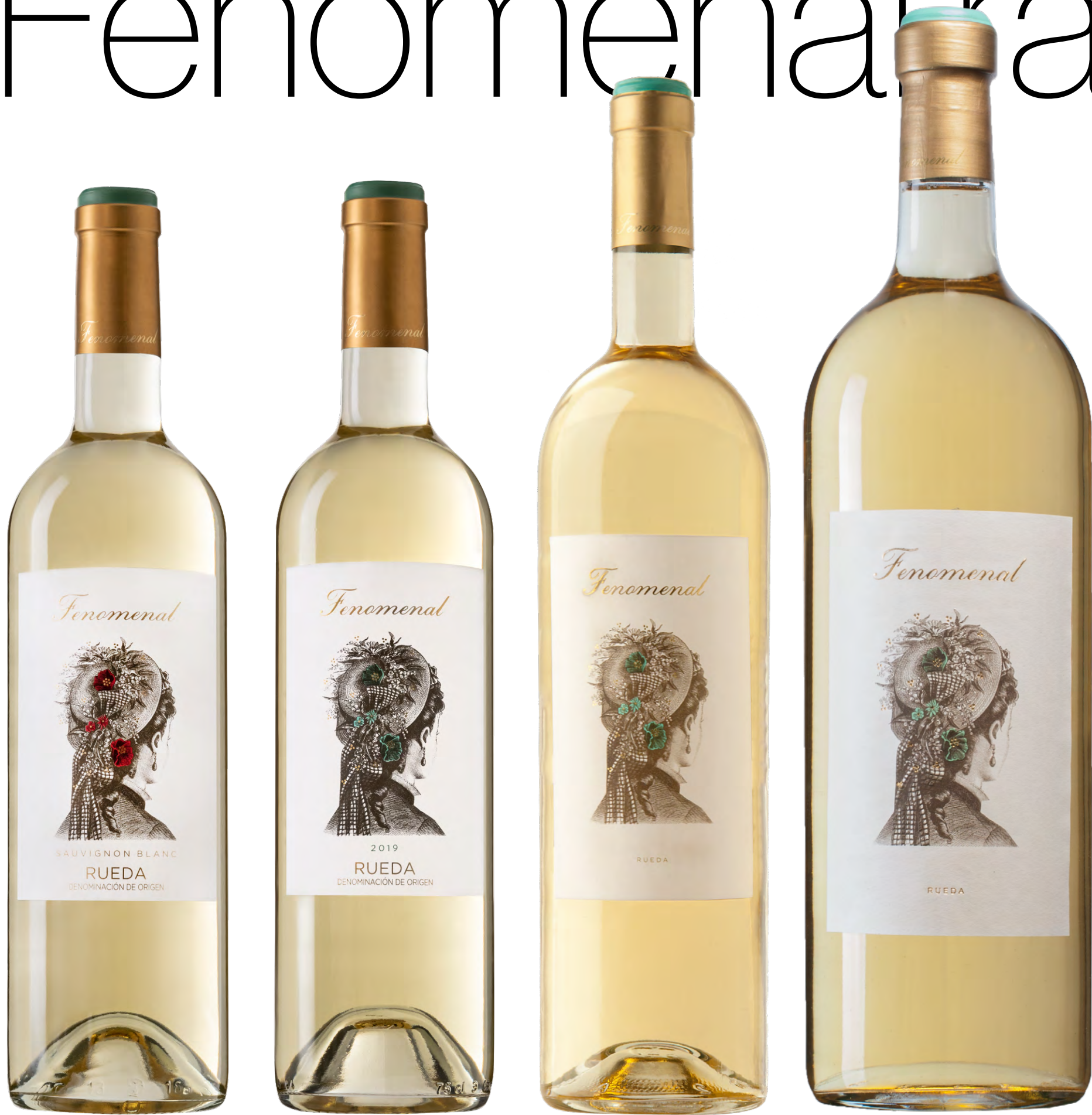
FENOMENAL SAUVIGNON BLANC FENOMENAL FENOMENAL MAGNUM FENOMENAL 3L